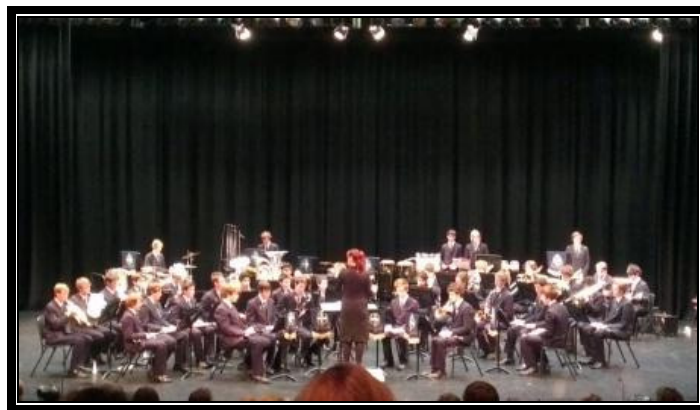
The Pre Tour Concert at the Wendouree Performing Arts Centre