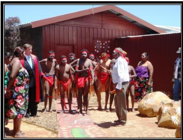
Students and Elders from the Timber Creek Community