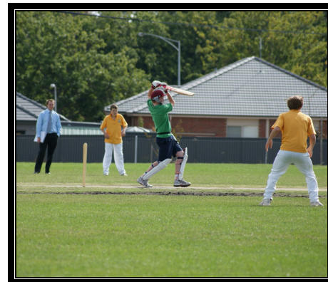
St Patrick's College House Cricket