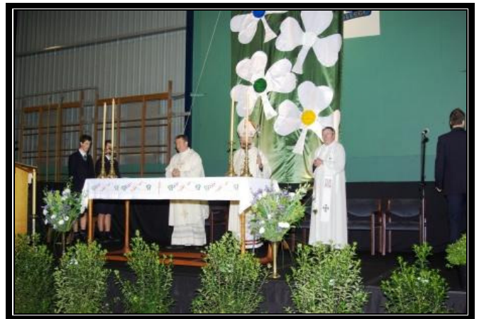
St Patrick's Day Mass