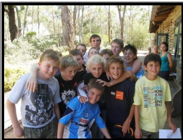
Year 7 Camp at Log Cabin Lodge Creswick

This week marks the first anniversary of the Nation's apology to the Stolen Generation. I pray that we at St Patrick's College are making progress in redressing past wrongs and opening the way to equality of opportunity for all Australians, including our Indigenous.