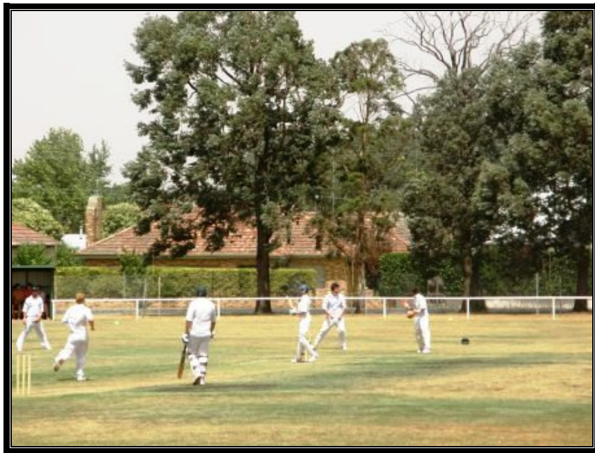
Year 7 Camp at Log Cabin Lodge, Creswick